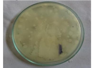
Figure.2. Presence of bacterial organism in fresh sample

The Biological tests on the sample gives the following results. We identified the following group of bacteria; Staphylococcus aureus (Yellow Pinpoint); Bacillus (Spread / Mucoid); Jantheno (Voilet); Chromobacteria (Voilet); Dugenella (Voilet); Streptococcus (White Pinpoint).