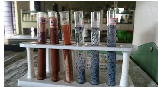
Figure.1. Neem and Tulasi seed power extracts in different proportions.

Disinfection : Particular media like Macconkey agar utilized for discovering restraint of bacterial development utilizing these seeds. Supplement agar is additionally utilized for list of bacterial check. The water prior and then afterward treatment is utilized for list. The diminishment in number of provinces was checked. This gives immediate evidence of antibacterial properties of tulasi and neem seeds.