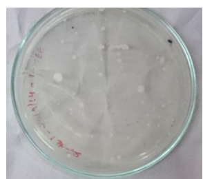
Figure.5. Bacterial growth reduction after treating with neem seed extract

Comparing the fig.2 & fig.3, we can clearly notice the reduction in the growth rate of bacterial organisms. Thus the tulasi seed extract acts as a disinfecting agent.